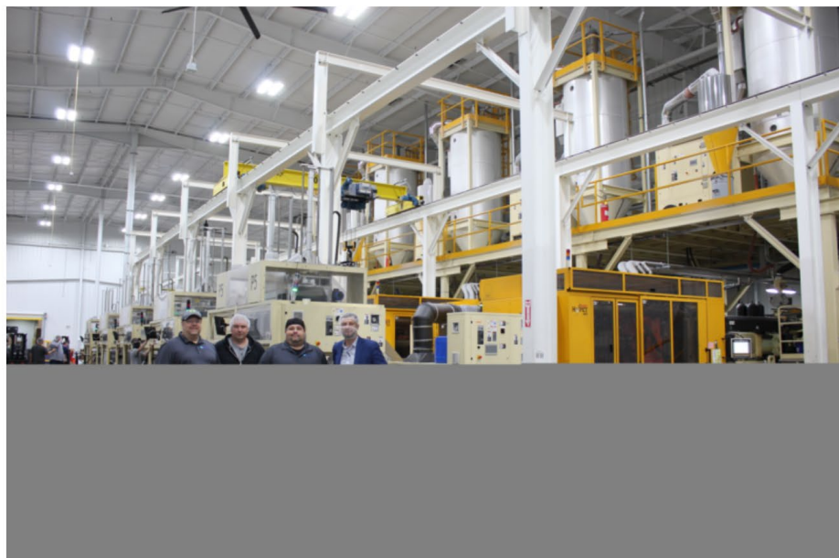
Inside at Retal PA